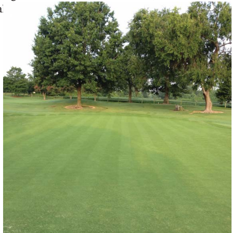
GCC Number 6 green almost ready