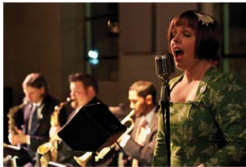
The Mint Julep Band

More details will be coming soon at www.greenvillecountryclub.com and in your September/October newsletter, so save the date!